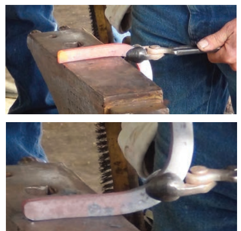
Working on face and at opposite edge of anvil, form your heels and heel check.