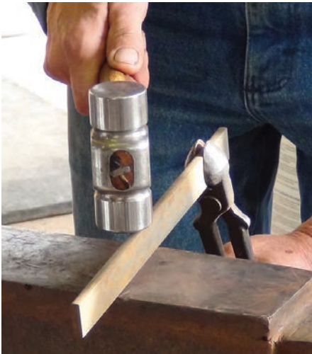
Start your toe bend working on the face or horn, making your first blow just off center.