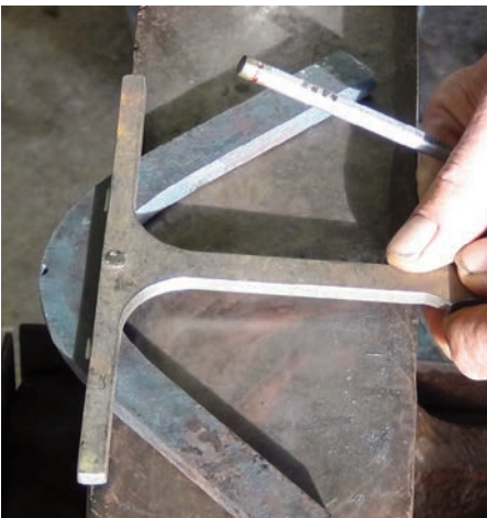
You can eyeball it or use a Bloom t-square tool to mark your toe nail.