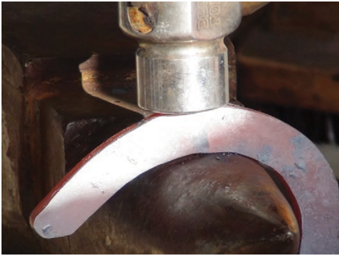
Work branch to clean up frog eyes.