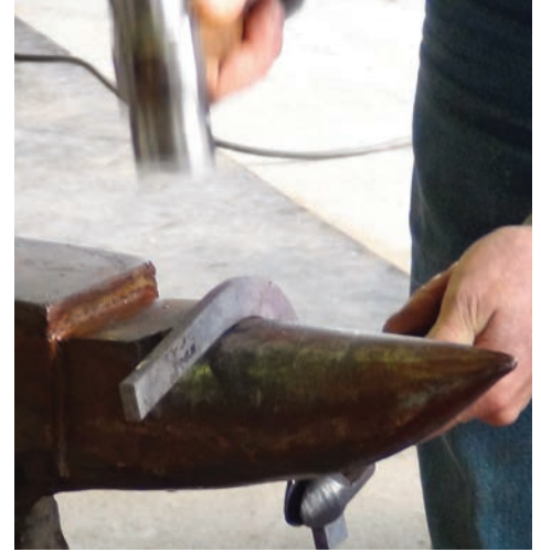
Keep stock in line and flat as you put toe in.