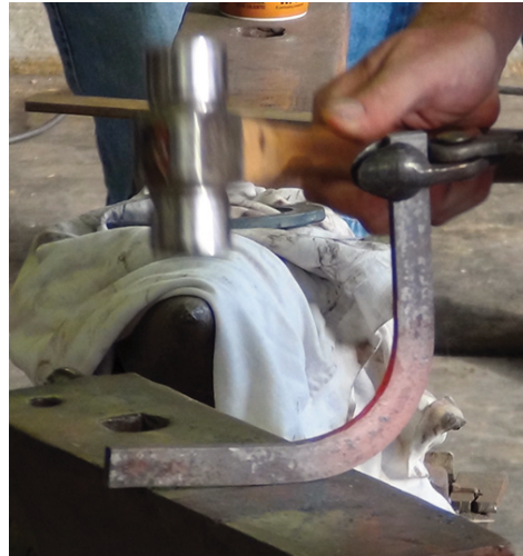
Working with round side of hammer, establish first one side of bend then the other.