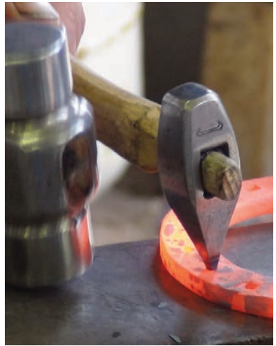
Forepunch to final depth, drift and pritchel.