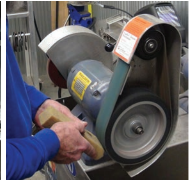
Turn on grinder. Maintain contact with belt and sweep side-to-side to clean.