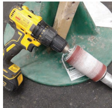
A hoof buffer sleeve loaded with hoof material.