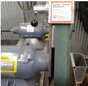
A zirconia belt with material loading present.

Using grinders and buffers becomes inefficient when one does not care for them properly.