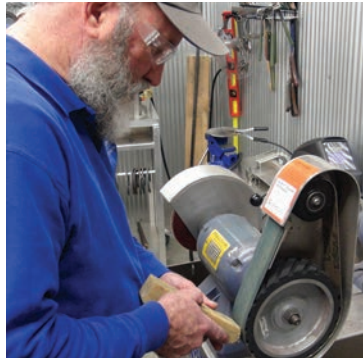
To clean belt, place rubber cleaning stick on belt at a 45° angle.