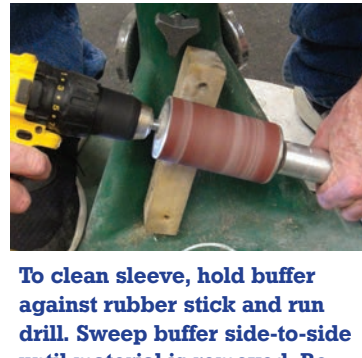
To clean sleeve, hold buffer against rubber stick and run drill. Sweep buffer side-to-side until material is removed. Be sure to set drill direction to ensure rotation is throwing material down and not up.