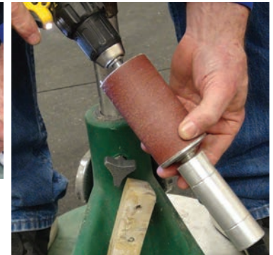
A clean hoof buffer.