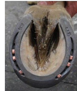
The extra thickness of the SX-10 provides more mechanics when you are rolling a toe.