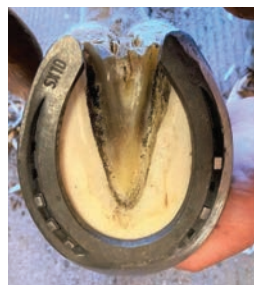
With just a little bit of grinding or hammer forging, boxing and bevels can be added where you need it, without sacrificing support.