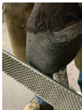
Rasping hoof with Hoofcast.