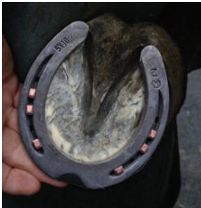
If you prefer toe clips, the unclipped SX-10 allows you to create a good solid clip without weakening the shoe.