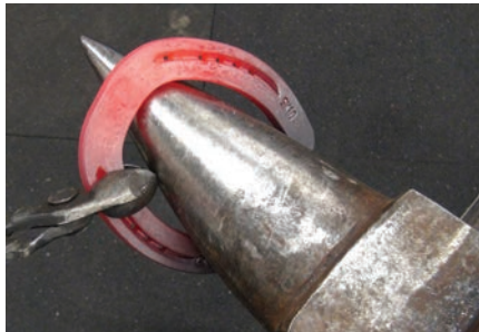
Kerckhaert's hind patterns generally need very little shaping to get ready for nailing. Note the built-in full toe width on all the SX-10's (front and hind).