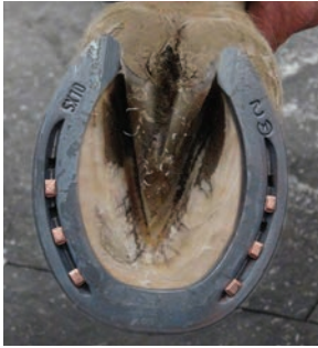
Example of a modification in the heels to enhance the cleanout. Liberty Cu Combo nails fit well in the V crease.

The newest options in the Kerckhaert's SX Series are the SX-10 Clipped and Unclipped front and hind pattern shoes. For anyone looking for a good base of support and enough material to make helpful modifications, these shoes may be the answer. Designed for the U.S. and Canadian market, the shoes have well placed punching for City, Slim or Combo nails. They also have shapes that suit many of the breeds you work on with minimal amount of extra work. Have a look at these images and think about the benefits of good shape, excellent quality steel and material enough to do what you want to do to keep your horses sound and protected.