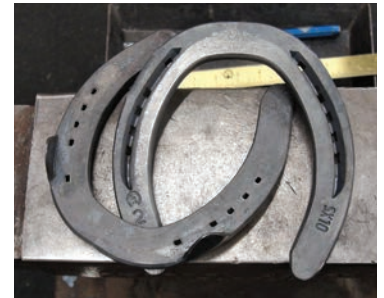
The SX-10 hind shape makes an extended fit easier with an appropriate nail pattern.