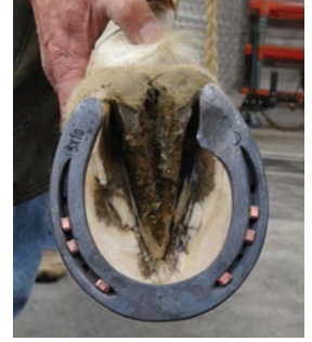
If you need some protection for a sore heel or corn, you benefit from having enough steel to get that modification done (onion heel).