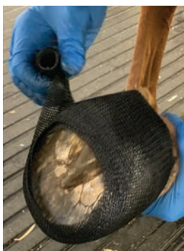
Wrapping hoof with Hoofcast.