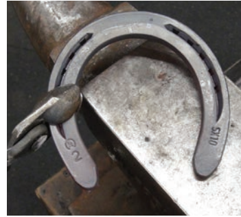
Full toe and good width in the heels complement the excellent front shape. V crease will accommodate a variety of nails including City, Slim or Combo heads.