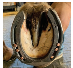
Get even more support by fulling the heel if needed.

CONNECT WITH FPD AND JOIN THE CONVERSATION