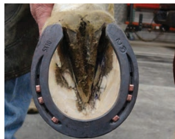
Add lateral support (front or hind) when working with SX-10 shoes.