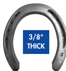
STANDARD MAX SIZES 0 - 3

Excellent for many applications, including school horses and general pleasure activities. Best nail choice - Liberty 5 Slim and 5 City.