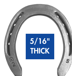
STANDARD EXTRA SIZES 0 - 3

Additional thickness and width in comparison to the Standard. Good shoe for modifications, ranch and trail work. Best nail choice - Liberty 5 Slim and 5 City.