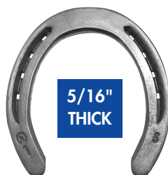
STANDARD SIZES 00 - 3

Excellent for many applications, including school horses and general pleasure activities. Best nail choice - Liberty 5 Slim and 5 City.