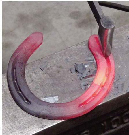
Using a Bloom steel handled creaser, Mike widens the lateral heel.