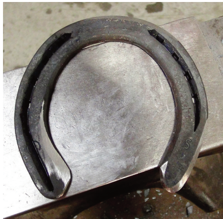
Wider lateral & narrower medial modifications set to go.