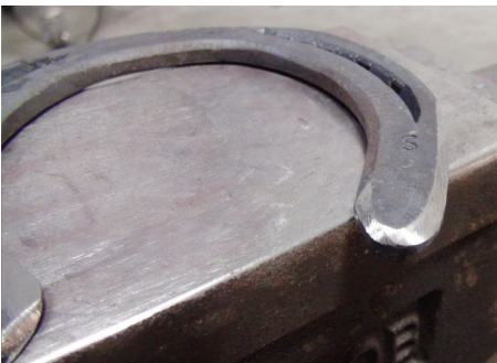
He then narrowed the medial branch on the Baldor to allow it to sink into the ground easier.