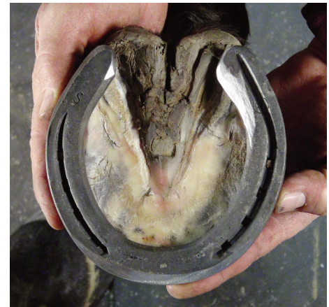
Final modification was to bevel the toe and the shoe is ready to go on. Note the bevel is greater at the point of breakover, not always the center of the toe. Frog will be cleaned up and get an application of SBS Thrus Stop Blue.