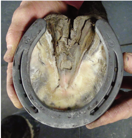
View at foot before modifications- note the condition of the frog, still to be dealt with.

View this article on FPD's Field Guide for Farriers » www.farrierproducts.com/fieldguide/western