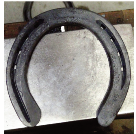
His second step was to forge the inside web of the lateral heel to be sure he had good foot coverage.