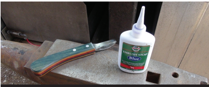
The weapons: Bloom Forge Loop Knife and SBS Thrush Stop Blue