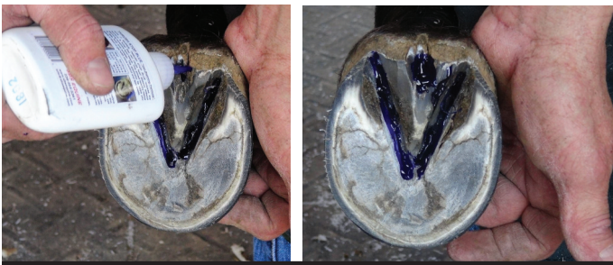
Notice how controlled and targeted the application of Thrush Stop Blue is. No mess with this product.

Check out this article by Dr. Steve O'Grady for invaluable information on thrush » http://www.equipodiatry.com/HowDoITreatThrush.html